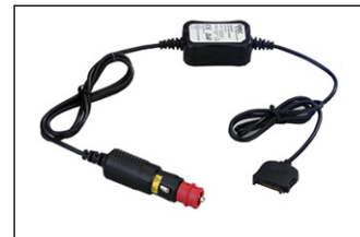
SPARE POWER PACK