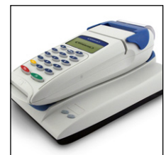
Portable with base station