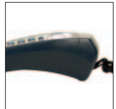
Handy for you and your customers

Hypercom's S9 line: it's the total transaction solution with benefits that you just have to touch to believe.