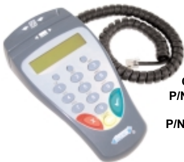
S9 PIN Pad

Connector Cord P/N 810022-010 (6 ft) or P/N 810022-009 (15 ft)