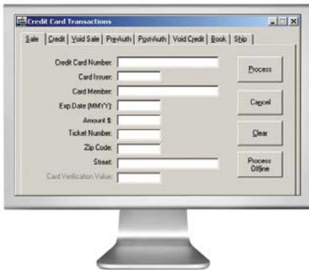
The Windows-based screens are intuitive and simple to use.