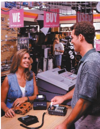
P8F printer in a retail environment